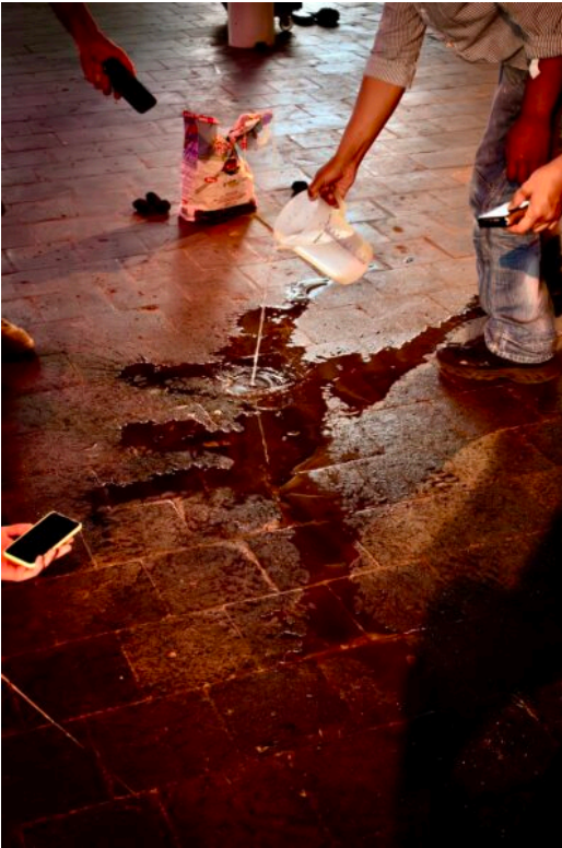
https://kiosk.art/unfixing-the-atlas 2024 — KIOSK Kunstensite / Ghent