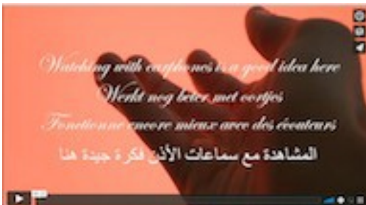
Mount Tackle (TRAILER)

2018 — UnSettled - KAAP/Argos/Raversijde, TAZ 2018 Oostende