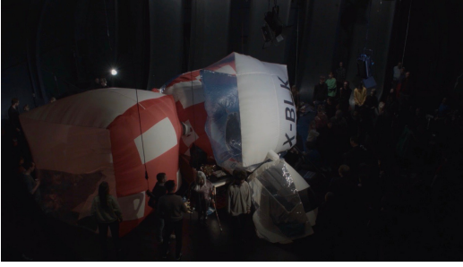
Mount Tackle (Revisited)